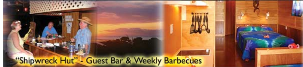
"Shipwreck Hut" - Guest Bar & Weekly Barbecues

All units have incredible ocean views and nightly sunsets. Located on a beautiful white sand beach on the west shore of Rarotonga!! The constant sound of the sea & surf will lull you into tranquility in this relaxing part of paradise. Enjoy Swimming, snorkelling, beachcombing and kayaking at all tides.